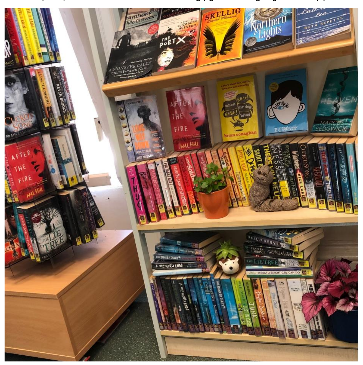
This year there is a children's book "shelfie" competition open until Monday 12<sup>th</sup> April 2021 if you want to try to win a complete set of the current shortlist – for terms and conditions check out this webpage <a href="https://carnegiegreenaway.org.uk/take-part/my-ckg-shelfie-alcs-book-giveaway/">https://carnegiegreenaway.org.uk/take-part/my-ckg-shelfie-alcs-book-giveaway/</a>